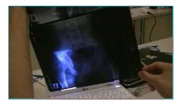
Figure 2: Screen shot from "my (im)perfect boyfriend", performance Inside Out, presented at ISEA'2011